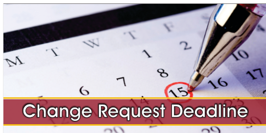
Change Request Deadline

Part of the fun of building a new home is selecting features, finish materials and colors. To make your selections, we provide you with up to 8 hours of professional consultation at the Mashburn Faires Design Center. Our Design Coordinator will assist you in achieving a design that considers your present and future lifestyle, family activities and traditions, as well as your entertaining style.