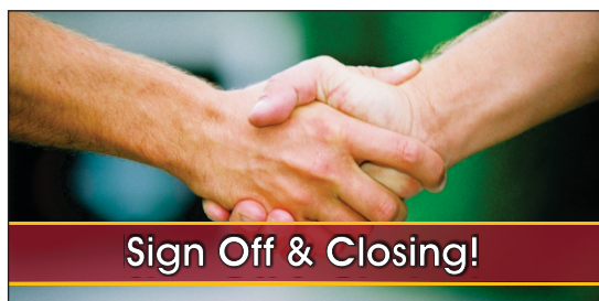
Sign Off & Closing!

The final orientation with your Construction Manager is an introduction to your new home and its many features. This meeting typically takes two hours as we follow a preplanned agenda and a set route through the home to ensure we cover everything. Our home orientation provides you with a demonstration of the home, review of key points about maintenance and warranty coverage and confirmation that we have installed selections and options as you ordered them.